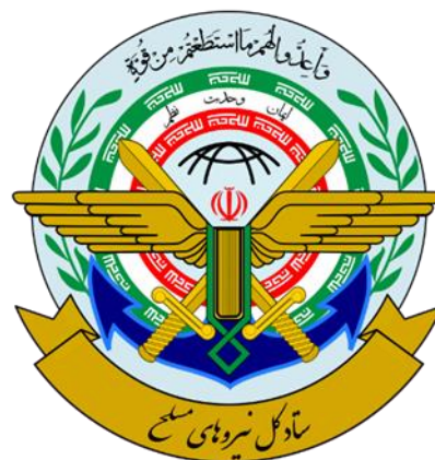
Above: On the right - the insignia of the Armed Forces Command (AFGS), on the left - Mohammad Hussein Bagheri.