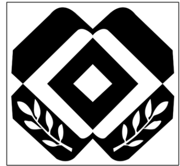
Above: Emblem of the Intelligence Coordination Council

Alongside the Supreme National Security Council, a coordination body called the National Intelligence Coordination Council was established. This council, which is under the responsibility of the minister of intelligence and security affairs, is intended to serve as a coordination body between the Supreme National Security Council and the country's intelligence agencies. This council is in effect an umbrella organization for the 16 intelligence and security organizations operating in Iran. Thus, for example, at least four intelligence and security organizations operate under the IRGC, apart from the intelligence apparatuses operating in each of the military branches. The chairman of the council in recent years has been Ismail Khatib.