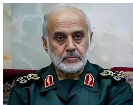
Above: Gholam Ali Rashid – head of Khatam al-Anbiya Headquarters.

The IRGC commander today is Hossein Salami. Salami was appointed to his position in 2019, after serving as deputy IRGC commander since 2009. Like many senior regime officials in Tehran, Western sanctions have been imposed on him.