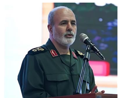
Above: Ali Akbar Ahmadian

In addition to these officials, there are two council members appointed by the Supreme Leader, one of whom usually serves as the council's secretary and official president. The current secretary of the Supreme Council is Ali Akbar Ahmadian, who was appointed to his position in 2023 and previously served in a variety of positions in the IRGC.