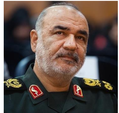
Above: Hossein Salami – commander of the IRGC

Salami was born in 1960 in the village of Vaneshan, near Isfahan. He joined the IRGC in 1980, shortly after the outbreak of the Iran-Iraq War and fought in the ranks of the organization. Over the years, he held a number of positions, including serving as commander of the 25th and 14th divisions in the ground forces, as a commander in the navy, and as commander of the air force from 2006-2009.